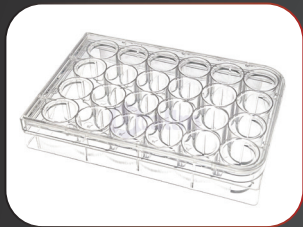
UNIFORM HOLE POSITION

TAURUSDISPO® Cell Culture Plate provides uniform and compatible surfaces for animal cell attachment and growth. TAURUSDISPO® Cell Culture Plates suit a multitude of experimental needs while providing cost efficiency for a wide selection of applications in your cell culture routine. TAURUSDISPO® Cell Culture Plate is individually wrapped with clear lot number for batch traceability. The TC Treated Cell Culture Plate has crystal-clear surfaces for distortion-free microscopy and multiple features that help reduce and prevent cross-contamination