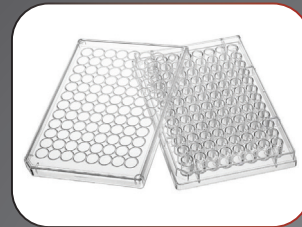
STERILIZED BY E-BEAM